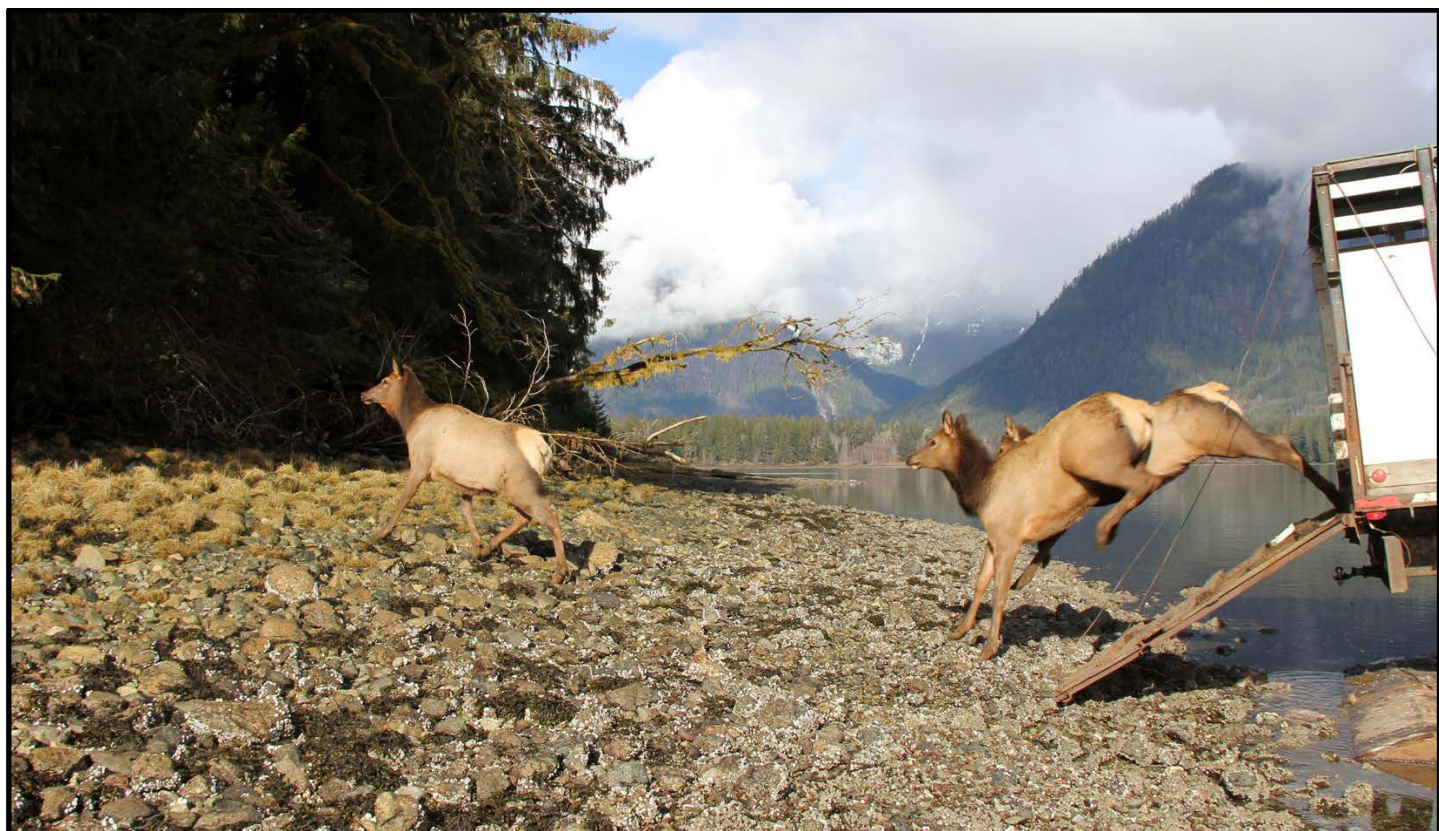
Translocated elk leave the truck in the Phelps Elk Population Unit on Vancouver Island (Project 1-599)